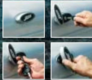
Jason ION® oval lock standard on Rage and Hugger